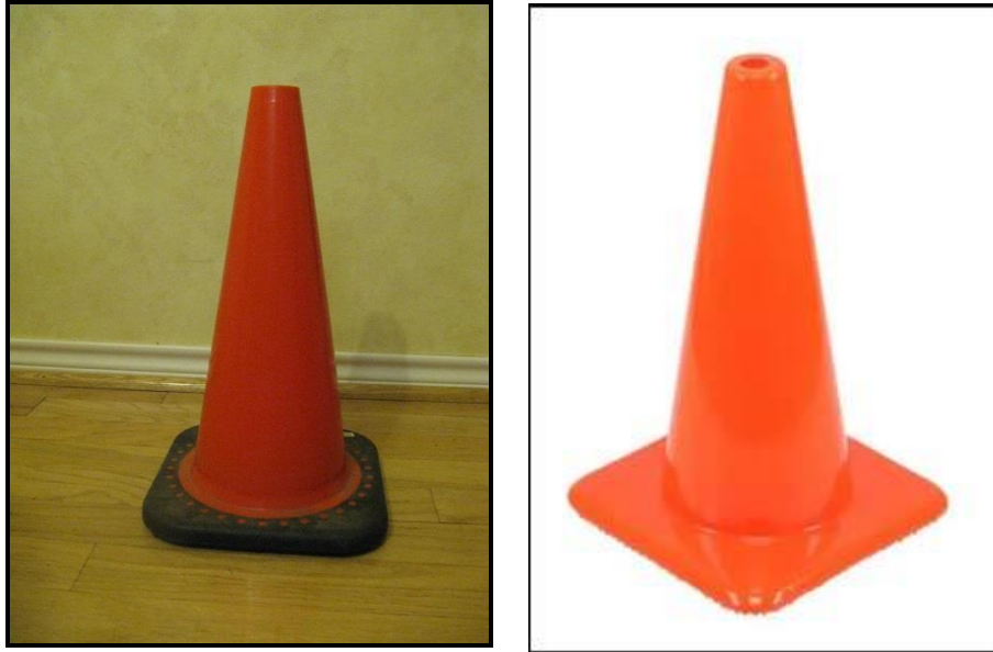
Acceptable Competition Cones

Cone: The cone used in the competition is approximately 17 inches high and is approximately 7 inches at the base of the cone. There are 2 styles of cones that can be used: one type sits on a black 10-inch square base and is the preferred cone, the other has an orange base. A judge can authorize a different style of cone. This possibility arises when the competition is run at a remote location where cones are already owned. The height of the cone and base is approximately 18 inches. The color of the cone is “traffic cone” or “fluorescent” orange. All cones used in the competition should be the same type. The cone and cone base are both considered “the cone”. Touching the cone base is equivalent to touching the cone.